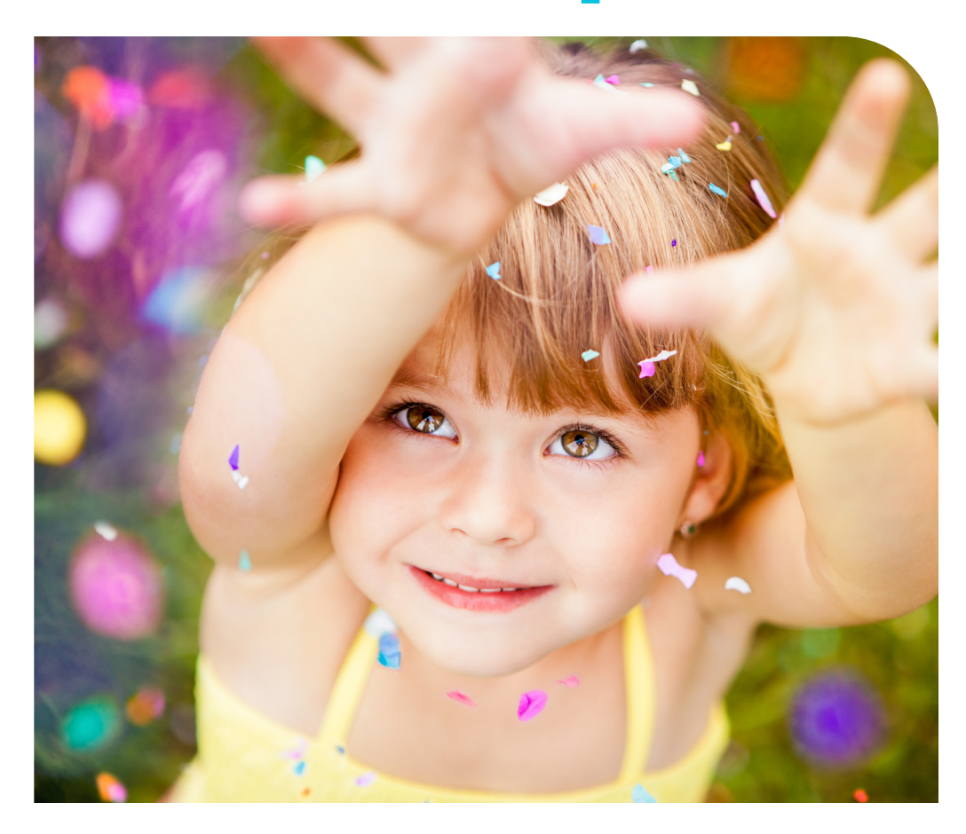
2023 Summer Class Schedule