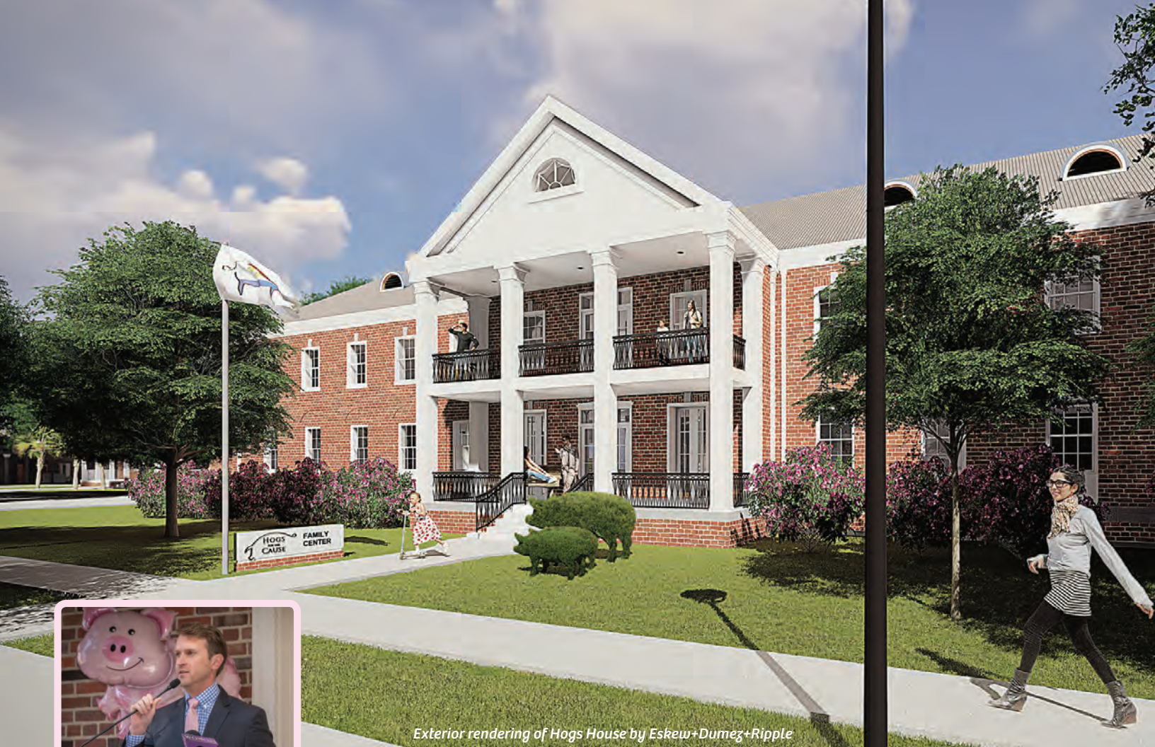
Exterior rendering of Hogs House by Eskew+Dumez+Ripple

Hogs House will provide a place to stay for families of children undergoing treatment at Children's Hospital. Overlooking the beautiful grounds of the hospital's State Street property, the space will house private family suites and shared living and dining areas with convenient access to the medical facility.