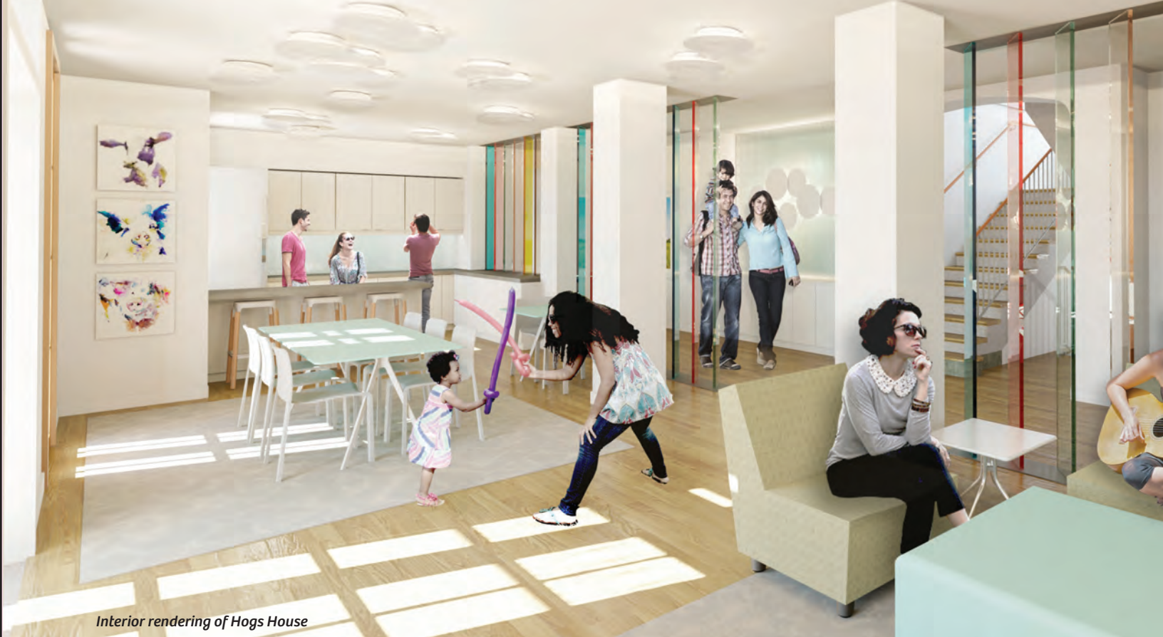
Interior rendering of Hogs House