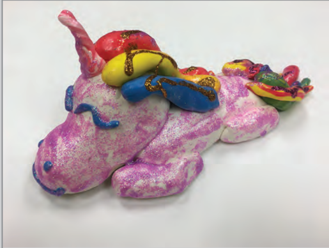
Sanaa Mitchell, age 10, "The Magnificent Bre," modeling clay