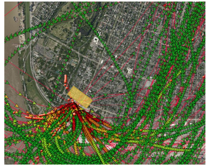
The yellow box indicates the neighborhood zone for flight avoidance whenever possible, as previously communicated.