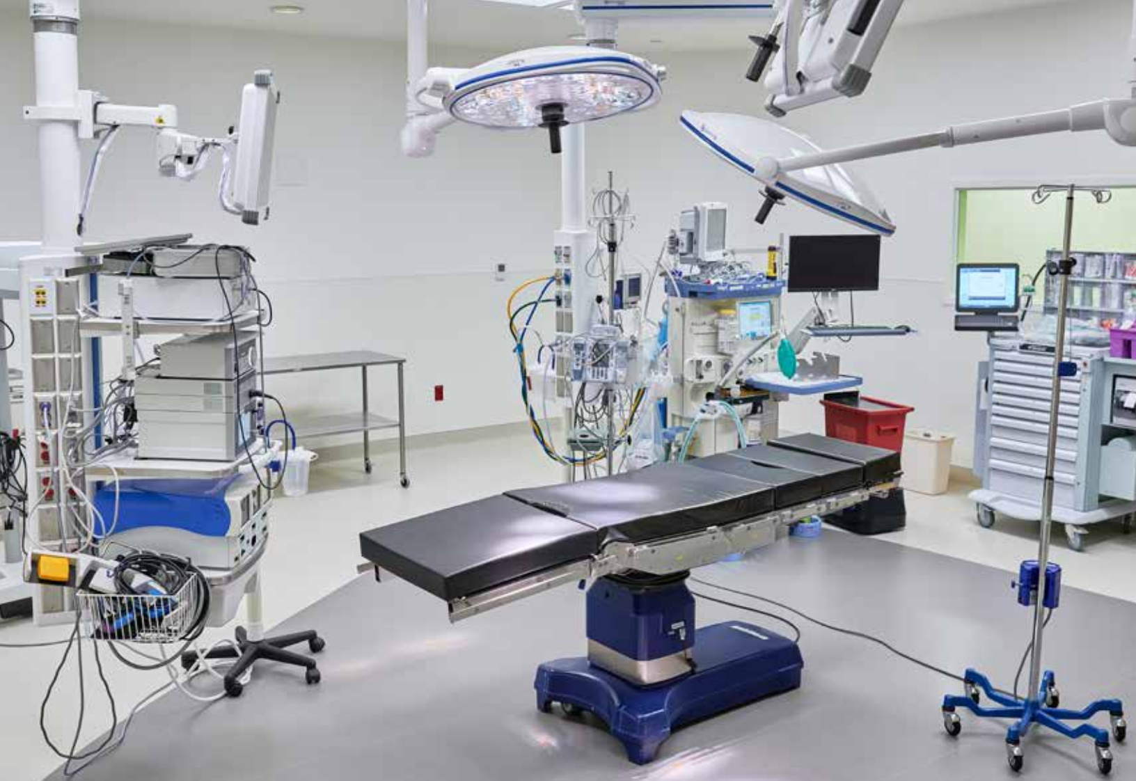
All new operating rooms opened in 2020 as part of Children's campus expansion.

American College of Surgeons (ACS), a hospital must have 24/7 coverage in the Operating Room, Radiology, and Pediatric Intensive Care Unit. Another requirement comes in the form of physician coverage, and includes general trauma surgeons, neurosurgeons, orthopedic surgeons, and anesthesiologists on call and backup call. Children's Hospital invested in bringing each of these services on board 24/7. In early 2021, the hospital had established all the needs for an effective trauma program, and became a Recognized Pediatric Level II Trauma Program by the State of Louisiana.