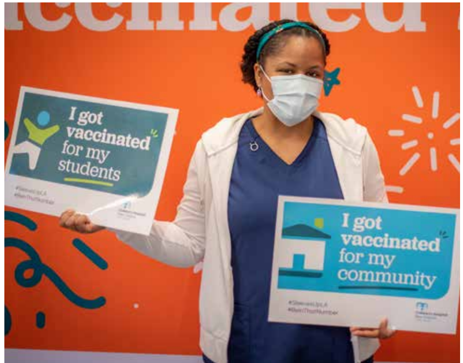
NOLA Public Schools nurses, teachers, and other staff rolled up their sleeves to receive the COVID-19 vaccine.

In this time of uncertainty, one thing has remained constant: Children's Hospital's unwavering commitment to creating healthier tomorrows for children and for our community. The hospital looks forward to the future with hope and continued motivation to stand in the gap and provide expert care for kids and support for those who care for them.