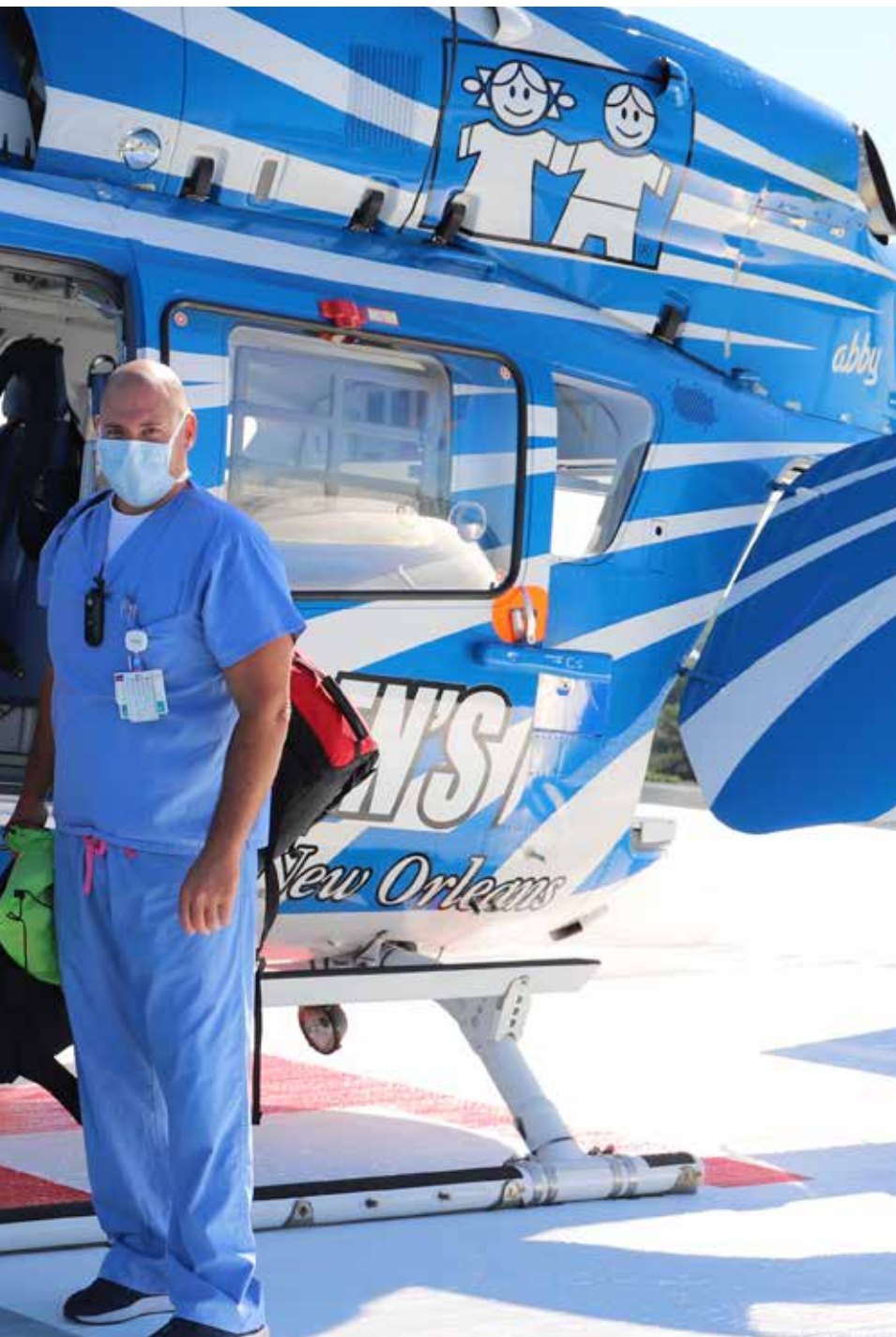
Children's Hospital's dedicated critical care transport team.

If there is one specialty that Children's Hospital New Orleans is known for locally, it is Emergency Medicine. Many children, and now adults, have come through the Children's Hospital Emergency Department, with a sports injury, broken bone, or even a late-night fever. But what about when a child has a more serious injury? In 2015, Children's Hospital leadership identified the need for more specialized emergency services