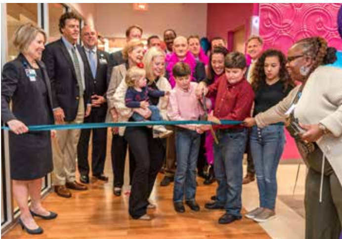
CICU ribbon cutting, February 2020