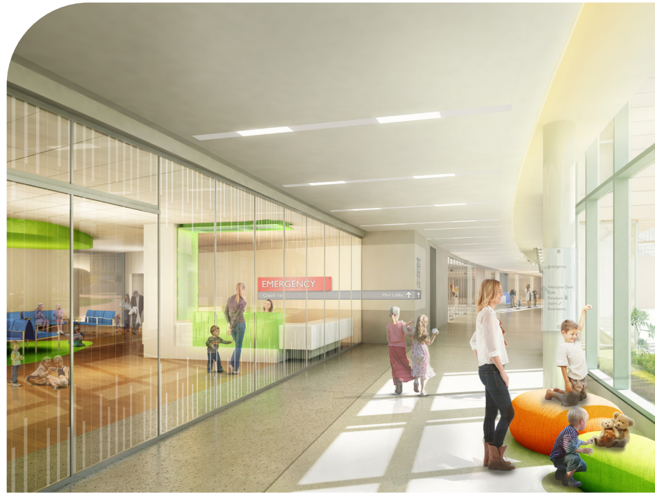
The new Emergency Department, opening summer 2021, will include eight specialized pods for acute behavioral health patients and a dedicated entrance.

The new Bartholomew Family Behavioral Health Pod of the ED is scheduled to open in July of 2021.