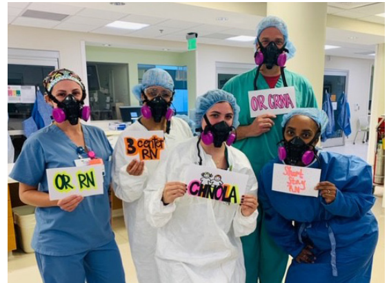
Children's Hospital nurses worked across LCMC Health to support our adult hospitals at the height of COVID-19.