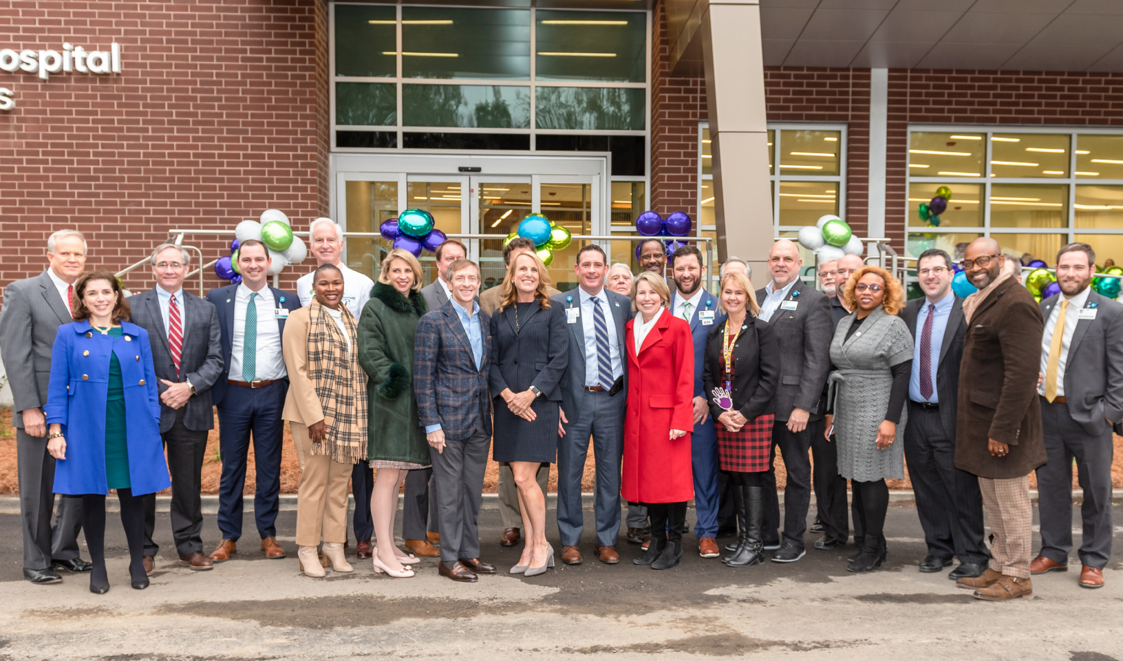
The grand opening celebration for the Behavioral Health Center was held prior to the COVID-19 pandemic.

The grand opening celebration kicked off with tours of the building for staff, community partners, and donors. A program followed with remarks from hospital and community leaders.